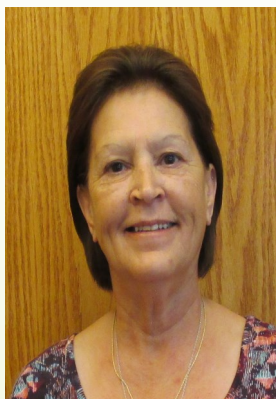
Mayor Lonelle Archuleta 2016—2018

Si desea recibir esta publicación en Español, por favor llame al 970-351-0041 y una copia Español será enviada a su dirección o pásate por el Ayuntamiento y recoger una copia.