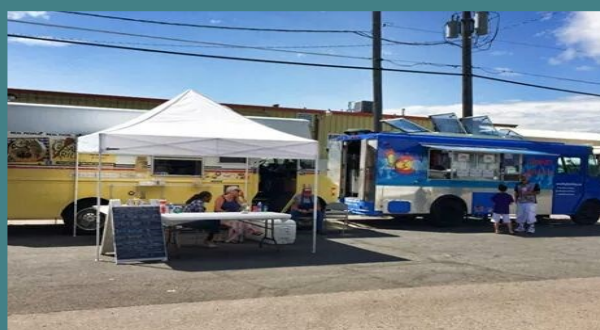
Food Trucks (above) and vendor booths (left) set up on 7th Ave