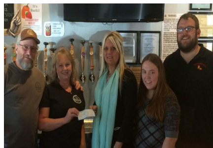
Broken Plow Brewing Co donates their $300 Bootleggin' winnings to Carehouse Greeley.