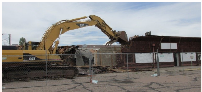
Agritrack Inc demolishes buildings on 8th Avenue to clear the way for 8th Avenue's future!

host special public meetings as they finalize the plans for 8th Avenue and beyond. All business owners and residents are encouraged to attend a meeting so that your voice may be heard. Be a part