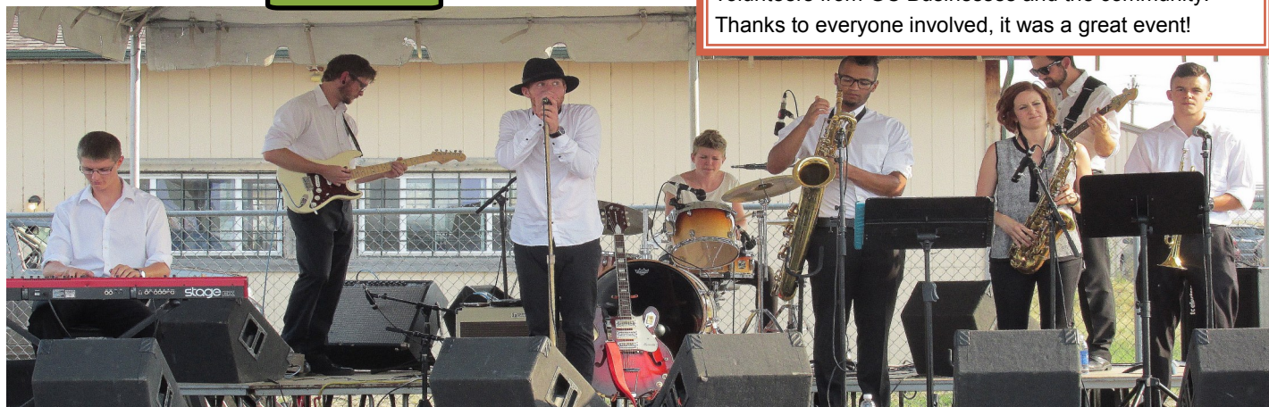
The Burroughs perform August 21st for a record breaking crowd!

The Garden City Business Association and the Town of Garden City worked together to host Bootleggin' Days on August 21st and 22nd. The weekend included a Brewfest and people's choice contest featuring 10 regional brewers who competed for their favorite charities. There were also food and retail vendors, live music, bingo and a children's activity area. We closed some of the streets and with a lot of cooperation from the surrounding residents and business owners, we hosted a fantastic event. Special thanks to Wing Shack, Smokey's, Nature's Herbs, VFW 2121, Matson Construction, Empire State Pizza and The Tavern who planned and coordinated the event. There were over 80 volunteers from GC Businesses and the community. Thanks to everyone involved, it was a great event!