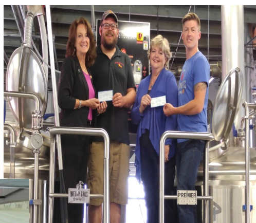
<People's Choice Award Winners of Bootleggin' Days Brewfest. From left: Weldwerks, Wiley Roots and Broken Plow.